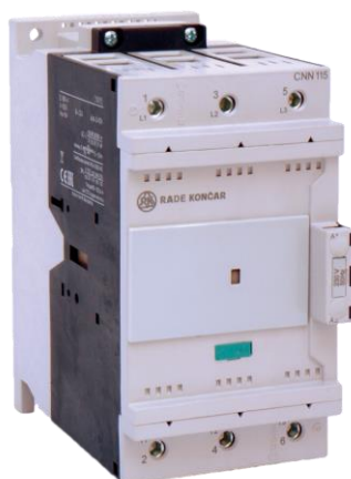
RADE KONCAR CONTACTOR CNN115 115A/55kW (AC3, 400V/50Hz); 130A(AC1) In conformity with standard IEC 60947-4-1